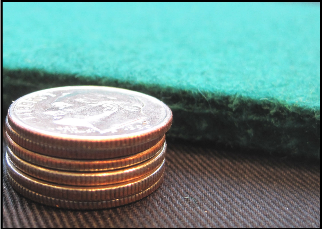
The thickness of heavy backrail cloth equals that of six dimes.

Very much so. As illustrated in the photo above, the felt used for backrail cloth (as well as balance rail and front rail punchings) is a very thick, dense felt that is designed to stand up to decades of constant use.