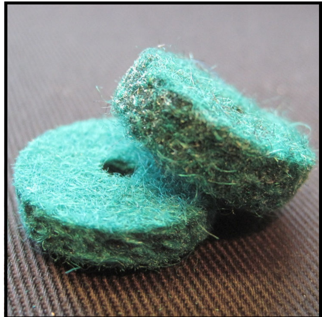
Thinnest and thickest front rail punchings.

Keybed felts come in a range of thicknesses, so that the original size of the felt installed at the factory may be duplicated. Paper and card punchings as thin as .002" are used under the felts for final adjustments necessary for level keys and even key dip.