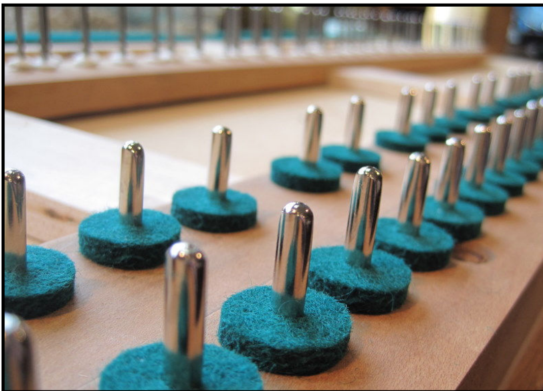
New set of keybed felts in place.

"In business to bring your piano to its full potential."