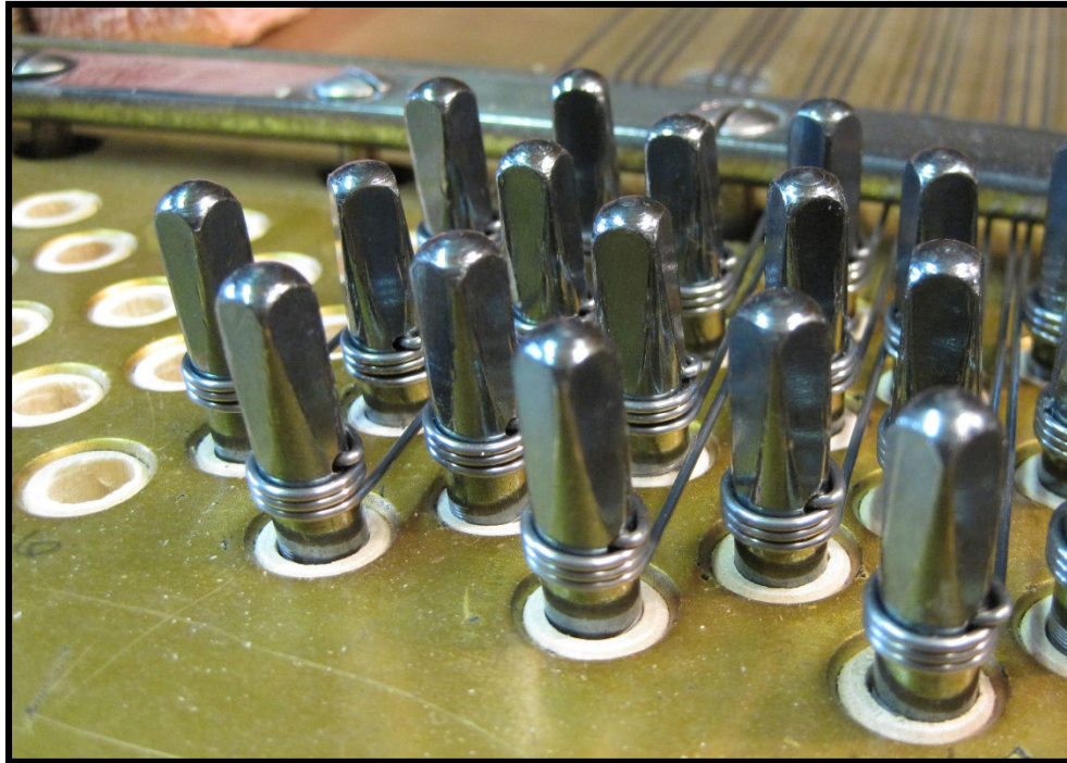
New tuning pins and strings being installed.

For a piano to maintain a stable tuning and sound its best, it is essential that the tuning pins are tight and that the strings are in good condition. When the tuning pins of a piano become loose and tend to slip, the piano will not stay in tune for a reasonable amount of time. When the strings have deteriorated to the point where they are breaking frequently, the tone of the piano will usually suffer as well. Your piano is showing symptoms of problems caused by brittle strings and loose pins which could be lessened or eliminated if your piano were to be repinned and restrung.