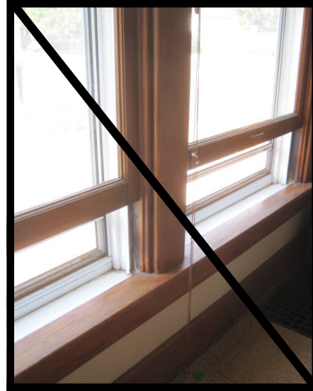
2. Drafty windows.

Note: Effective humidity control equipment, either for the home in general or the piano in particular, will aid in keeping your piano in top form.