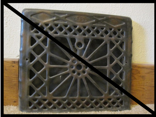
1. Hot air registers—dry, heated air blowing directly on the back of a piano is particularly bad for the soundboard.

Environment: While tuning, repairs, regulation and voicing are the job of the technician, seeing to it that your grand piano is placed in an appropriate spot within your home is up to you. What is needed, as much as possible, is a location where temperature and humidity are kept at moderate levels year-round. Drafty locations, or areas where wide swings in either temperature or humidity occur (unheated porches, moldy basements, etc.) are unsuitable for a piano. In particular avoid placing your piano in front of either of the following: